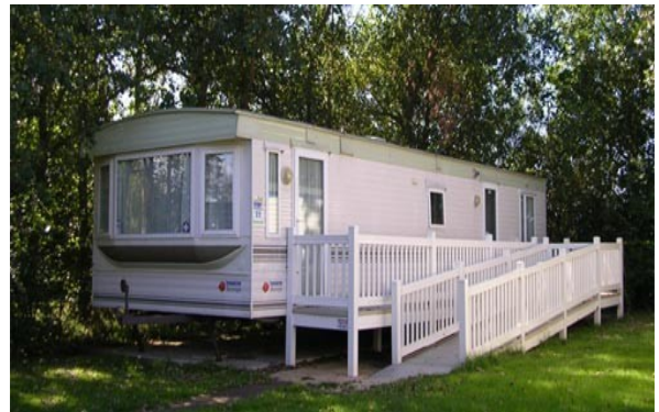
All the Trust's caravans and chalets are wheelchair

All the Trust's caravans and chalets are wheelchair accessible. They have a purpose-built ramp, and the unit doors - inside as well as the outside - are wide enough to allow access for all standard-size manual wheelchairs. There is sufficient room inside the accommodation to allow for a wheelchair to get alongside the bed, the toilet, the meal table, the shower, and to be able to move freely in most areas.