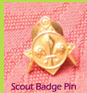
Scout Badge Pin

Gold metal scout arrowhead and square and